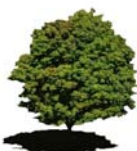
Beaufort Hill Ponds & Woodlands Preservation Society